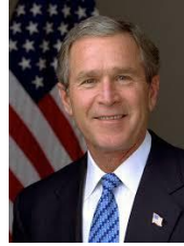
President George H. W. Bush

George H. W. Bush defeated Michael Dukakis soundly, becoming president in January 1989.