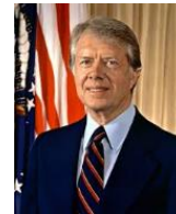
President Jimmy Carter

Jimmy Carter defeated Gerald Ford in the presidential election, taking office in January 1981.