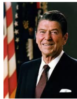
President Ronald Reagan

Ronald Reagan won a landslide election over President Jimmy Carter and took office in January 1985. Under conservative government, NROTC regained prestige lost during and after the Vietnam War.