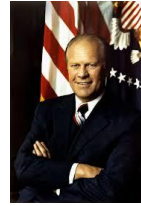
President Gerald Ford

Gerald Ford was elected president, serving 1977-1981.