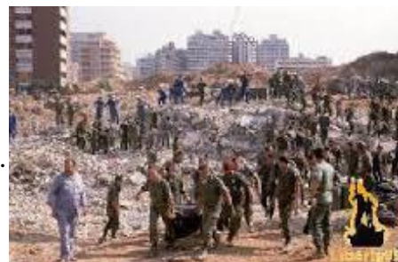
Beirut 1983 bombing.

American military made up part of peacekeeping forces in Beirut, Lebanon. On this day two suicide truck bombers struck a building housing U.S. and French troops. Killed in the attack were 220 U.S. Marines, 18 U.S. Navy and 3 U.S. Army men: the worst single-day U.S. military death toll since Iwo Jima.